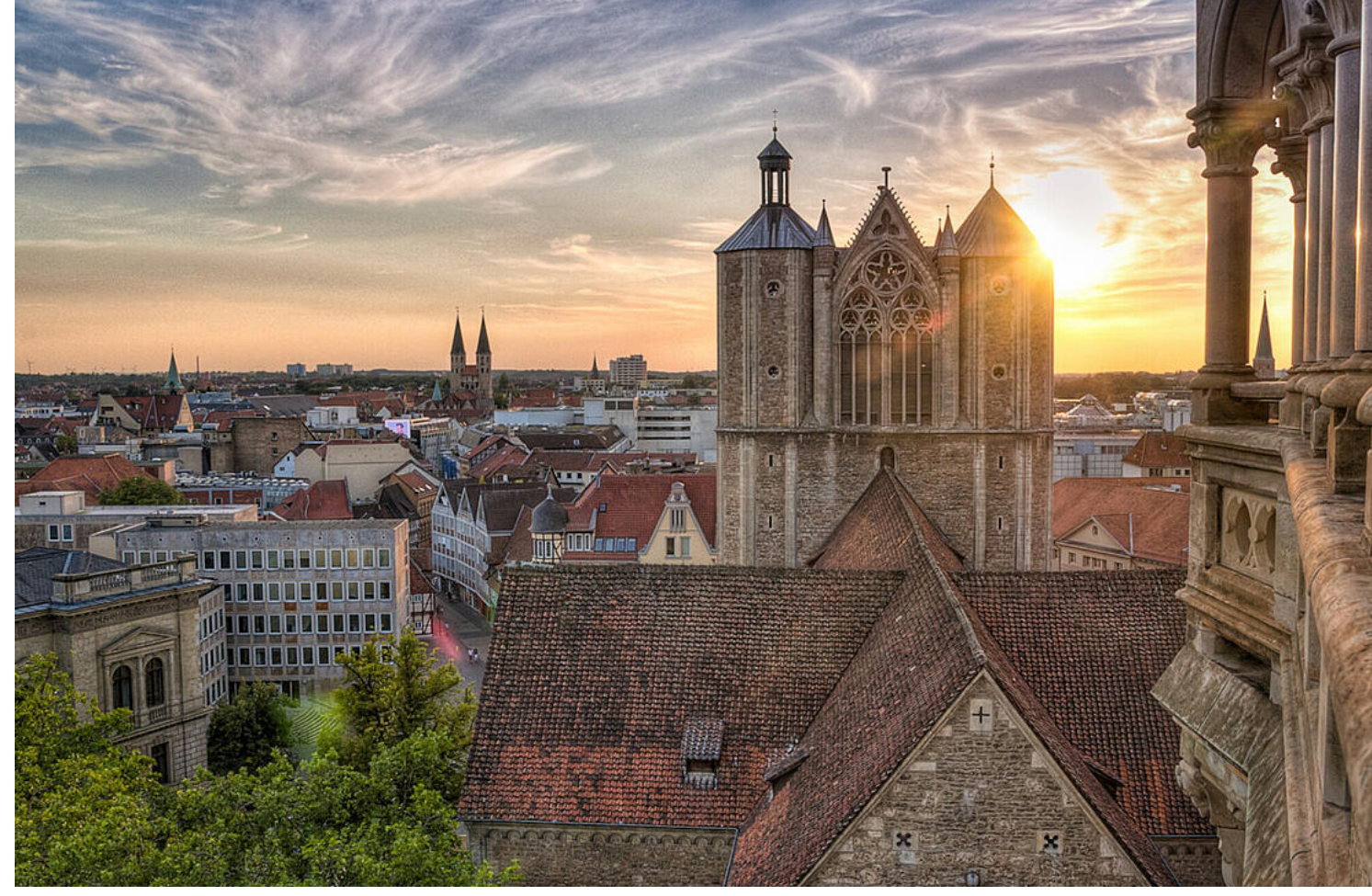
Source: The cathedral St. Blasii in Braunschweig, Germany! Shot from the tower of the town hall. Braunschweig Stadtmarketing GmbH/Markus Hörster

The Braunschweig region is one of the most inventive regions in northern Germany. There are around 20,203 patents for inventions in Braunschweig. If these were converted to the nearly 250,000 inhabitants, about every 13th Braunschweig resident would have a patent for an invention.